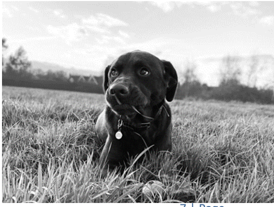
Sophia Marsh 7 | Page